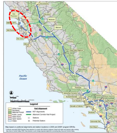
California High-Speed Train Map, Statewide Overview