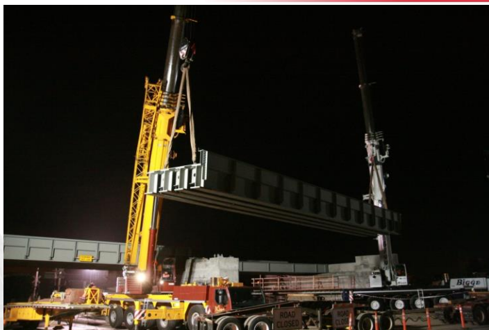
Bridge Girder Installation, San Mateo Avenue