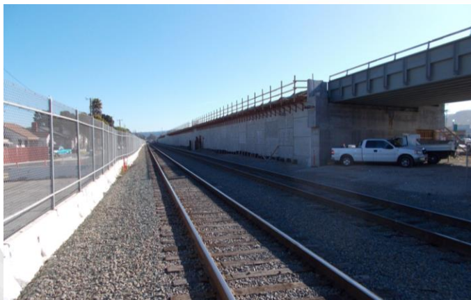
Shoofly Tracks & Completed MSE Wall along First Avenue